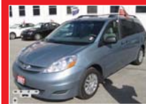
2007 Toyota Sienna Auto, 4 dr., air, anti-lock brakes, dual air bag $21,900