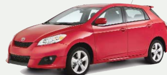
2009 Toyota Matrix

* Rebates and gas cards on select models. See dealer for details.