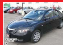
2007 Mazda3 Auto, 4 dr., air, anti-lock brakes, CD player $16,800