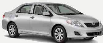
2009 Toyota Corolla

BEST SMALL CAR IN 2009 CANADIAN CAR OF THE YEAR AWARDS.