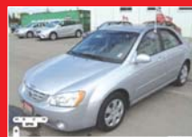
2006 Kia Spectra Auto, 4 dr., AM/FM stereo, air, CD player, p/steering $12,900