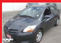
2008 Toyota Yaris Auto, 4 dr., air, anti-theft, keyless entry, dual air bag $16,900