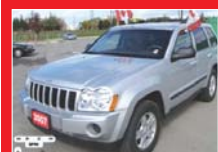
2007 Jeep Grand Cherokee Laredo, auto, 4 dr., AM/FM stereo, anti-theft $21,900

UP TO 40 PRE-OWNED VEHICLES SPECIALLY PRICED FOR OUR 4 TH ANNIVERSARY SALE!