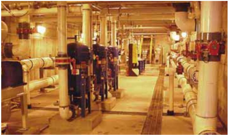
East Boulder Mine – Water Treatment Plant.

“There were over 1,000 miners and support staff going to the mines every day, which created a lot of traffic on our rural, winding roads,” Hawk says. “After five years of busing employees, the mine could see that it was money well spent. Absenteeism