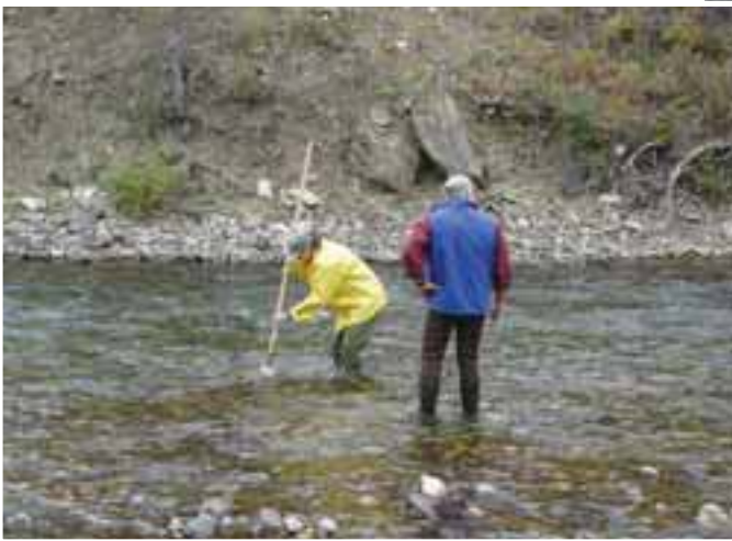
Good Neighbor Agreement sampling.