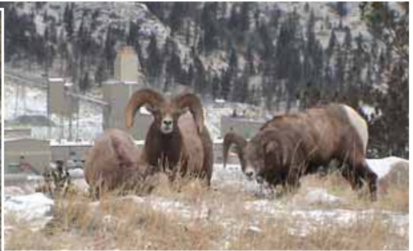
Rams on Stillwater Mine property

as individuals, and this establishes trust,” he says. “You also get to see the other side’s position and discover that you share common interests. A strong working relationship means that you can be up-front and get down to business on the issue at hand.”